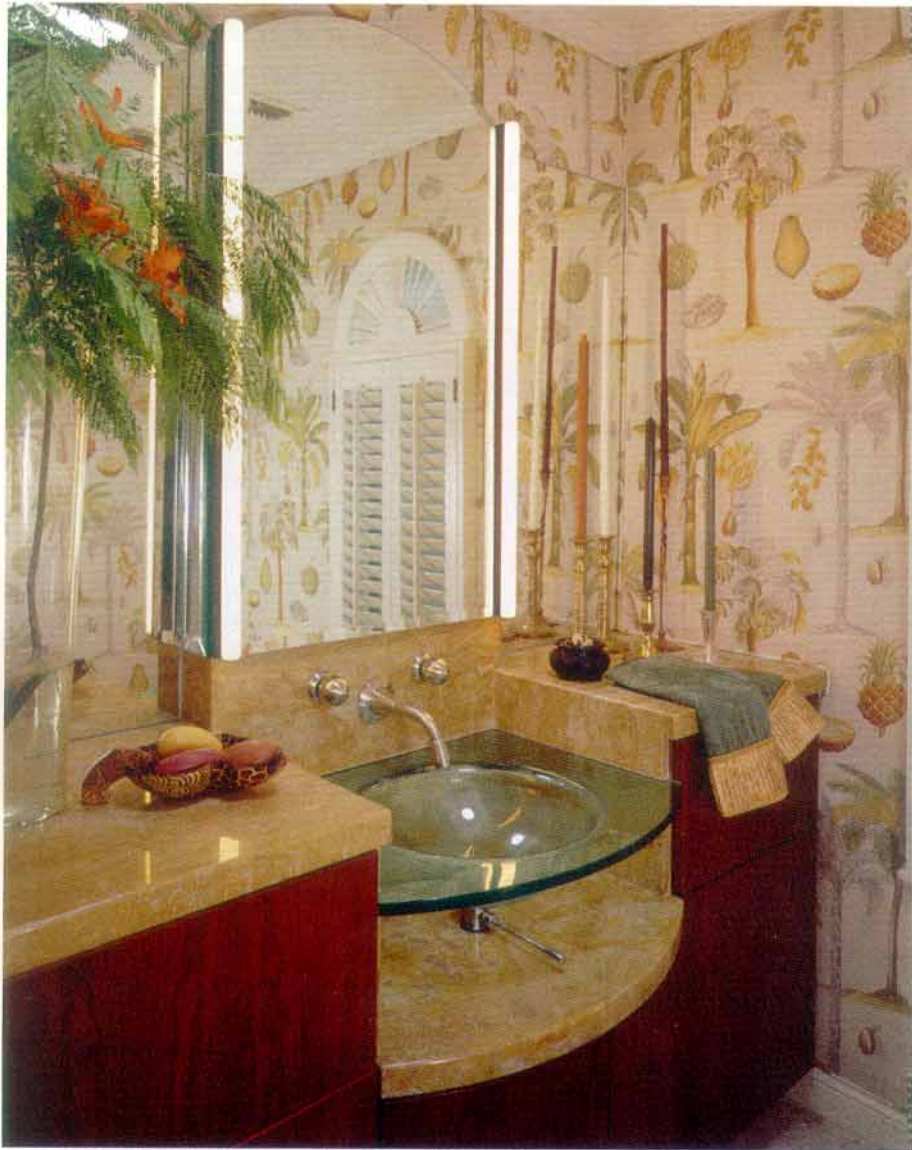
Tropical print wallpaper transforms an ordinary bathroom into an oasis.

of creative wall coverings. Versa's unique wall textures include Círculo , an embossed damask design of burnished, free form circles, Alloy , the swirled texture of brushed metal and Filigrane , suggestive of wood grain and watermarks.