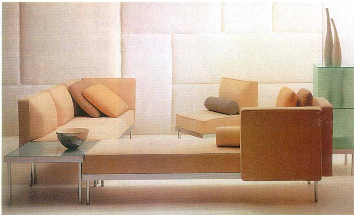
Epic Furniture Group